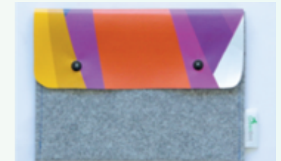
Example: limited editions of cardholders using carpets and vinyl banners. Ask for the catalog to search for other customized products available.